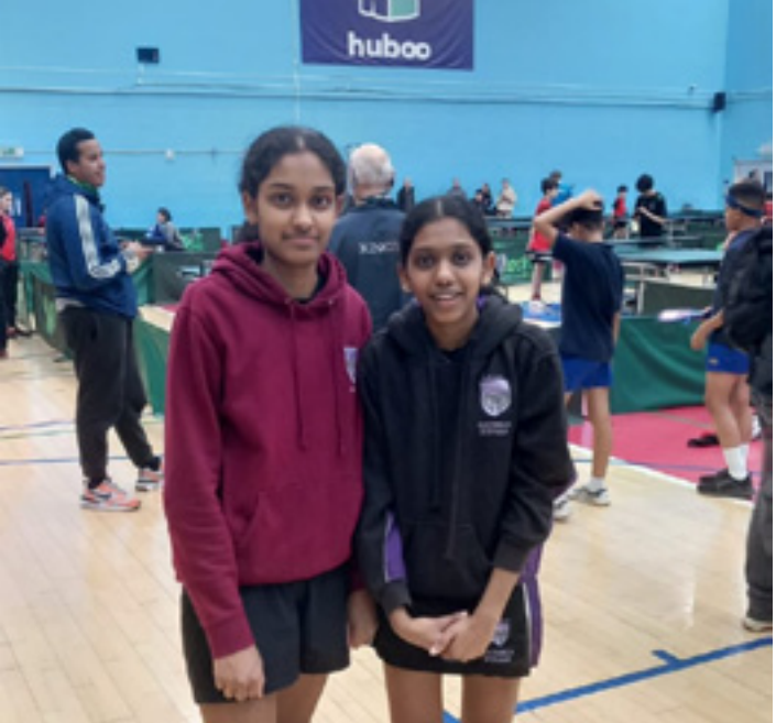
For more regular updates, follow us on Instagram