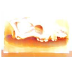
Too bright and blown out