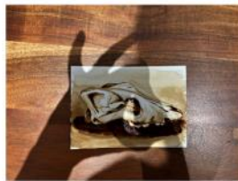
Too much background, too many shadows.

If you can lean or stick your picture to a wall, you are less likely to cast shadows on it