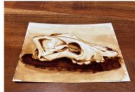
Weird angle, too much background