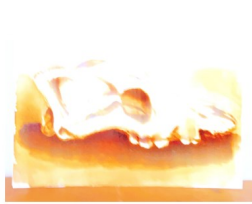
Too bright and blown out