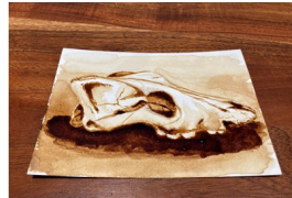
Weird angle, too much background