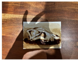
Too much background, too many shadows.

If you can lean or stick your picture to a wall, you are less likely to cast shadows on it