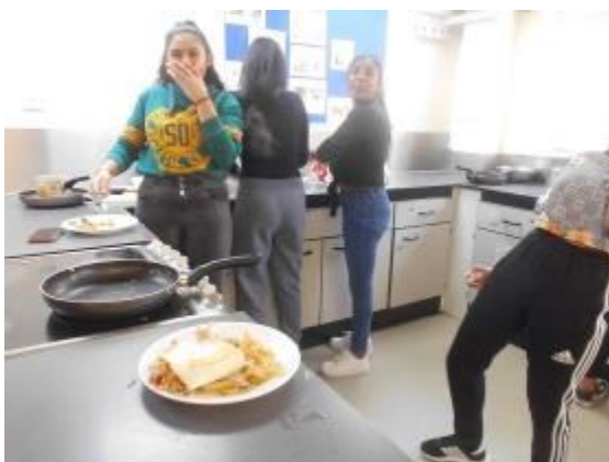
Sixth Form—Independent Living