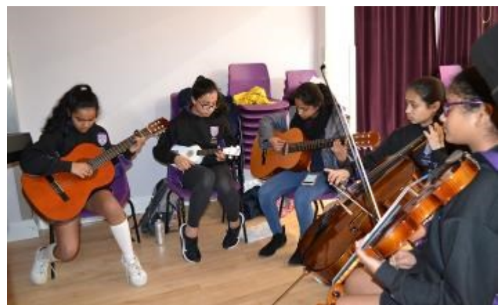
Art, Dance & Music