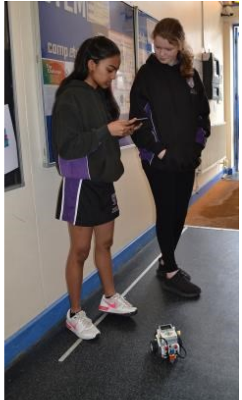
Technology, Science & Sports