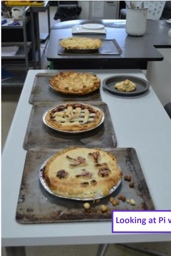
Looking at Pi with some pie making!